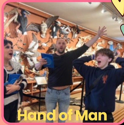
Hand of Man