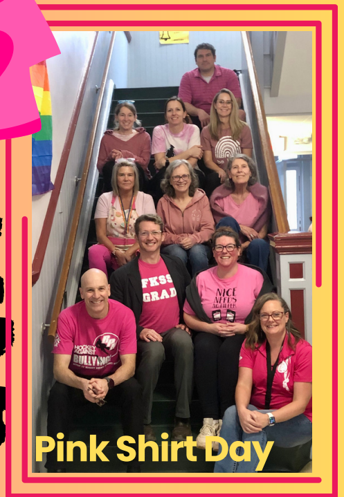
Pink Shirt Day